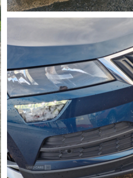
Skoda Karoq 2.0 TDI SE Technology 5dr

2019 2.0L DIESEL MANUAL 2 KEYS PETROL BLUE METALLIC PAINT 90,306 MILES WILL COME WITH 12 MONTHS MOT LOW GROUP INSURANCE £12,995