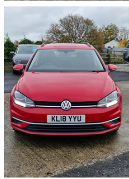
Volkswagen Golf 1.6 TDI SE 5dr [Nav]

2018 1.6L DIESEL MANUAL 2 KEYS TORNADO RED SOLID PAINT 116,433 MILES WILL COME WITH 12 MONTHS MOT SERVICE HISTORY LOW GROUP INSURANCE £7,950