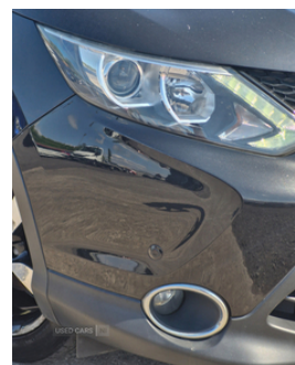
Nissan Qashqai 1.5 dCi N-Tec 5dr

2015 1.5L DIESEL MANUAL 2 KEYS PEARL BLACK METALLIC PAINT 68,202 MILES MOT UNTIL SEPTEMBER 2025 SERVICE HISTORY £20 ROAD TAX LOW GROUP INSURANCE £8,500